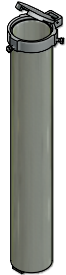
WITH HINGED CAP